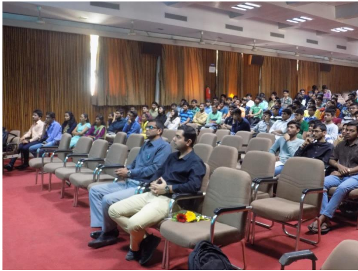
Valedictory Function in Progress