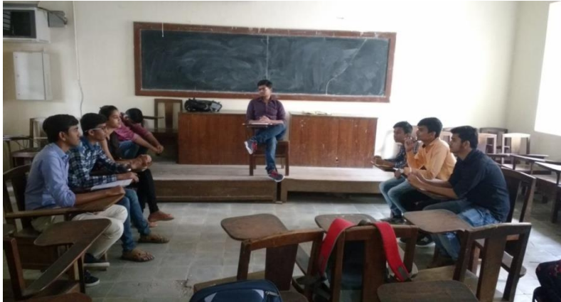
Debate Round in Progress