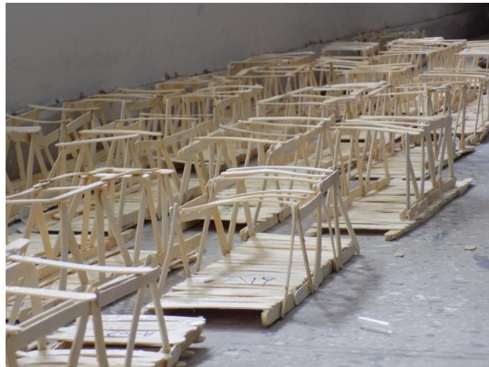
Bridge Samples Made by Students