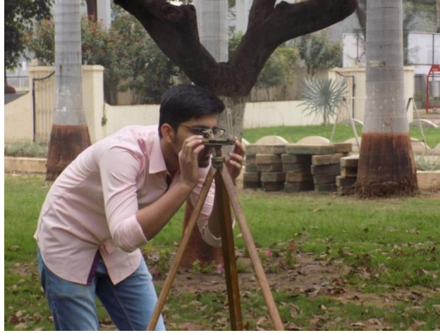
Student Performing Field Survey