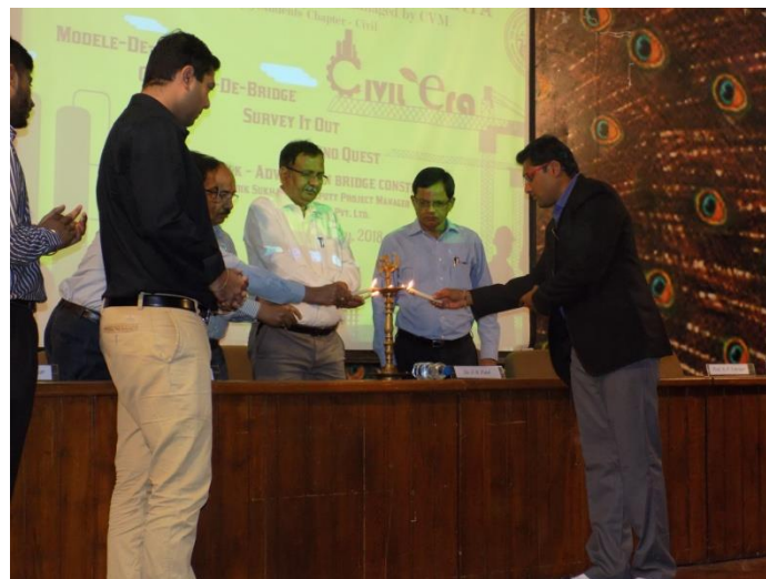
Dignitaries Lighting the Lamp

A Techfest was organised by BVM Engineering College from 5/2/2018 to 10/2/2018 in which around 500 students had participated enthusiastically.