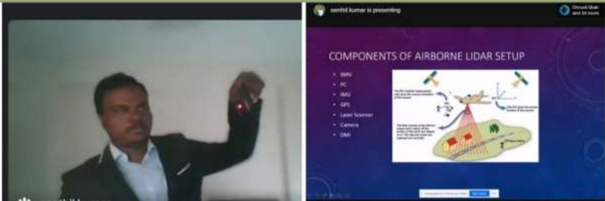
Speaker delivering the session

“Use of LIDAR Technologies in Highways Infrastructure Development” A webinar Organized by IE(I) Students’ Chapter Civil, Birla Vishvakarma Mahavidyalaya.